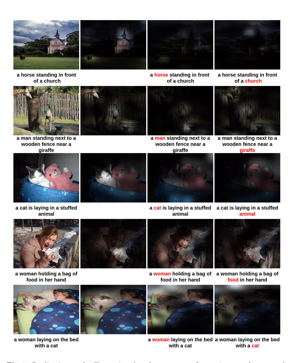
Fig. 5. Qualitative results illustrating that the two types of attention complement each other in various situations. From left to right: original images with generated captions, stimulus-based attention maps, top-down model attention maps for different words within the captions. The word associated with a specific top-down attention map is highlighted in red color.