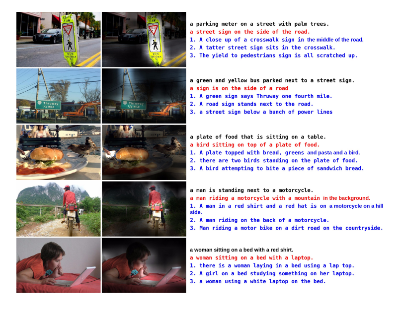
Fig. 4. Qualitative results for models with and without using the Boosted Attention method. From left to right: original images, stimulus-based attention map, and captions corresponding to the images. Captions generated by models with and without using Boosted Attention method are colored in red and black respectively, while the ground-truth human generated captions are colored in blue.

In addition to quantitative evaluations, in this section we further demonstrate the effectiveness of proposed method via comparing qualitative results computed by models with and without using our method. Figure 4 shows the captions generated based the two models, together with the corresponding stimulus-based attention maps computed by models using the Boosted Attention method. Stimulus-based attention maps are generated by normalizing the average activation within the CNN features at different spatial locations.