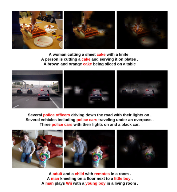
Fig. 2. Visualization for image captioning attention and stimulus-based attention. From left to right: original images, ground truth image captioning attention maps, stimulus-based attention maps. Captions are shown at the bottom of the images with objects of interest mentioned in multiple captions highlighted by red color.

it exists (i.e. P(d|e)) is around 0.2, thus stimulus-based attention increases the probability of selecting objects of interest by more than 2, providing reasonably good prior knowledge of the objects of interest for image captioning. However, note that since stimulus-based attention commonly attends to only parts of the salient objects instead of covering all or sometimes even majority of the pixels in the objects, the correlations between stimulus-based attention and captioning attention are not high, with CC = 0.222, SIM = 0.353 and Spearman = 0.324. Thus, even though stimulus-based attention is capable of partially capturing objects of interest for image captioning, solely relying on stimulus-based attention may not be sufficient for an image captioning model. Figure 2 shows examples of captioning attention and corresponding stimulus-based attention. We see that stimulus-based attention, while correctly locating objects of interest (i.e., cake, police car, man, remote and boy), it typically covers part of the salient regions displayed in the captioning attention maps.