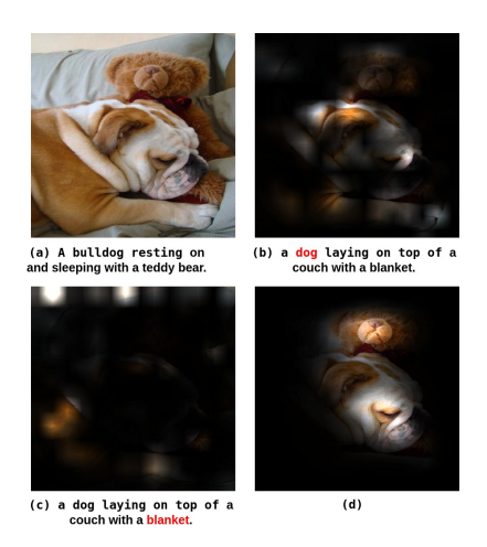
Fig. 1. Top-down attention may fail to focus on objects of interest. (a): original image with human-generated caption, (b-c) two top-down attention maps and their corresponding model-generated captions, and (d) stimulus-based attention map for the image. Words related to the top-down attention maps are colored in red.

Human attention is driven by both task-specific top-down signals and task-independent visual stimuli. For visual tasks such as image captioning, humans would naturally deploy their gaze based on both top-down and stimulus-based information during the exploration. As a result, the objects being mentioned in the same image by different people are largely consistent and correlated with the objects highlighted by the stimulus-based attention [35]. Therefore, we propose that the visual stimuli can be a reasonable source for locating salient regions in image captioning, which can also complement top-down attention that relates to specific tasks. In Figure 1(d), we see that stimulus-based attention successfully attends to regions corresponding to objects of interest as mentioned in the human-generated caption.