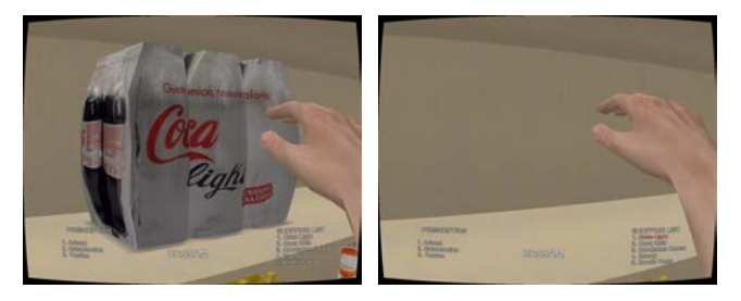
Fig. 4: Object selection, by a right-handed person, in our second generation VEGS.

Although this represents a new platform, the new iteration of the VEGS maintained the neuropsychological characteristics of the original MET-based VEGS. The neuropsychological assessments included both a time-based and an event-based prospective memory task. A written list of shopping items was provided in order to counter the impact of impaired memory in the distractor task. The scenario was designed to accurately resemble real-world procedure. For the time-based measure, two points were awarded for turning in the prescription within two minutes of the time limit, and one point for turning the prescription in after a oral reminder. For the event-based measures three points were awarded for returning to the pharmacy within two minutes of hearing their number called the first time, two points for retrieving the prescription within two minutes of the second announcement, and one point following an on-screen reminder.