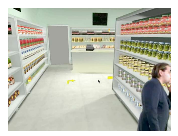
Fig. 2: A view of the VEGS from a participant's perspective.

The measure we developed involves a number of brief, shopping-type errands that must be completed in a real environment following certain rules that require problem solving. Activities in the VEGS are designed to parallel the MET. There have been other attempts to develop a VR adaptation of the MET. In one adaptation, patients with executive deficits completed fewer tasks than age matched controls, just as they did in the real version of the task [23]. However, no additional conditions were used to increase task demands. In our development of the MET-based VEGS, we aimed to systematically vary the information load (which affects goal maintenance) to offer an advanced VR version of the Multiple Errands Task. We use multiple adaptive trials in the assessment procedure. This is accomplished by creating a pool of "multiple task assignments", empirically determining their baseline difficulty, and then adding conditions in the environment that affect baseline task difficulty by manipulating the density of items on shelves, the similarity of packaging, and the intensity and