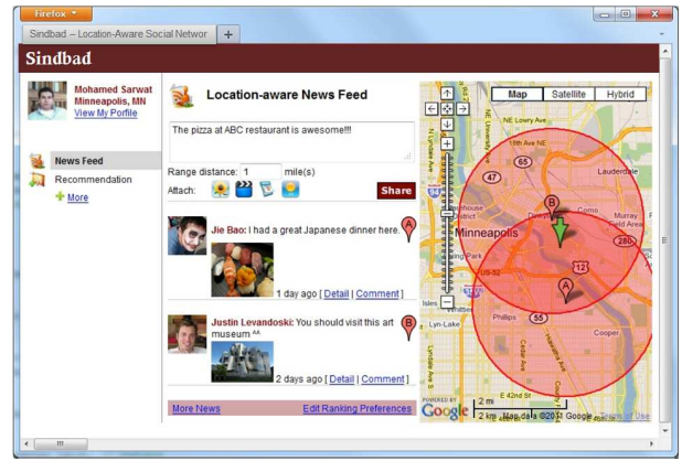
Figure 2: Sindbad Web Application ScreenShot

Sindbad produces recommendations using non-spatial user ratings for spatial items by employing a travel penalty technique that accounts for item locations embedded in the ratings. This technique favors recommendation candidates the closer they are in travel distance to a querying user. Sindbad employs an efficient query processing framework capable of terminating early once it discovers that the list of recommended items cannot be altered by processing more candidates. Finally, to produce recommendations using spatial ratings for spatial items , Sindbad employs both the user partitioning and travel penalty techniques to address the user and item