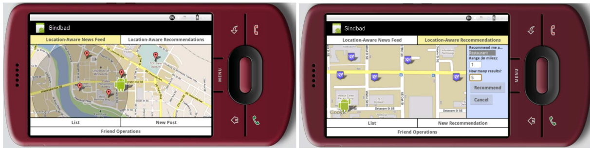
(a) Location-Aware News Feed