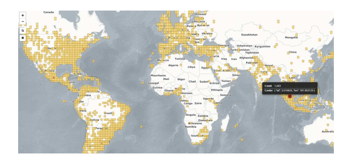
Figure 4: A snapshot of indexed data packets at a fine level of the hierarchical tree