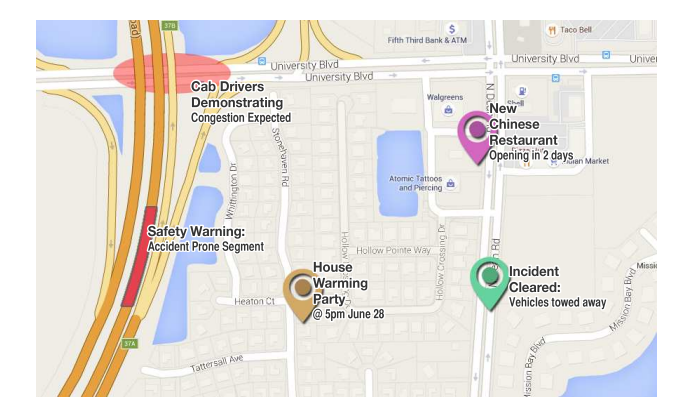
Figure 1: Conceptual illustration of Event-Enriched Maps: Findings automatically discovered from live streams, such as a restaurant opening, a neighborhood party, an accident prone road segment, warnings on demonstrations and emergency cases.

dles unstructured social streams, particularly Twitter data, and implements different algorithms for the efficient extraction, clustering, and mapping of live crowdsourced events. Hadath consists of several components as follows. Data collection involves gathering social data with different forms: data chunks and streams. The data wrapping and cleaning component digests streaming data, and prepossesses data to generate structured data packets from unstructured streams. The data manager stores data by implementing a indexing scheme to allow efficient and scalable access to raw data, as well as to extracted events. The events of interest detection module classifies and extracts events based on a multidimensional and hierarchical clustering technique, which defines the spatial scope and the level of abstraction of detected events. The query engine creates best query plan based on map zoom level, spatial and temporal characteristics, and executes the query plan in order to retrieve EOIs efficiently. The visualizer provides a new dimension to existing maps by illustrating extracted knowledge from live collected data as live events at different levels of abstraction. The remainder of this paper is as follows. Section 2 highlights related work and challenges from different perspectives. Section 3 introduces our proposed architecture with results; while Section 4 draws conclusions and discusses future work.