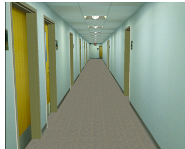
Figure 1: the virtual hallway environment used in the experiment.

(for ordinary walking). The navigation methods were presented in a balanced order between subjects using Latin squares and we explicitly avoided describing the methods in any way, not even by name, to avoid inadvertently biasing or otherwise influencing participants' opinions or ratings. At the beginning of each trial, participants were simply instructed to point the wand, which was also tracked with the HiBall system, in the direction they wished to travel, press the trigger (which activated the augmentation of the tracker output in modes B and G, and controlled the direction and duration of travel in mode J), and, except in the case of method J, to begin walking. After traversing the hallway from end to end using each navigation method, participants were given a short survey in which they were asked to 1) identify the methods that they liked best and least overall; 2) rate each of the methods on a seven point scale according to various criteria; and 3) provide written comments relating what they liked and didn't like about each navigation method. We created separate surveys for each possible presentation order, so that each participant would answer the questions about the methods in the order that s/he had experienced them (to minimize any opportunity for confusion between methods).